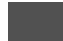
Granite Crystal (M)