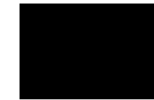
Brilliant Black (M)