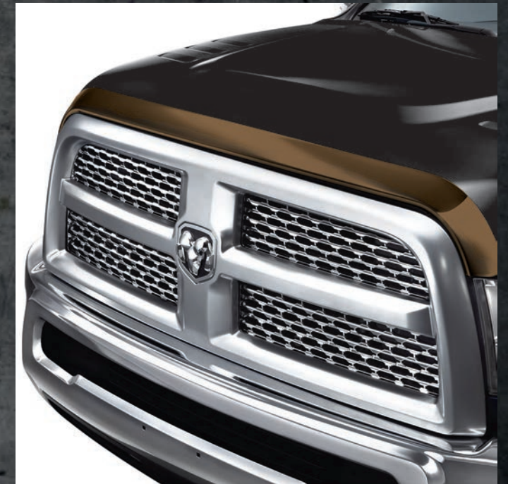
BONNET AIR DEFLECTOR (SMOKE EFFECT) 82212765