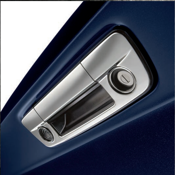
TAIL GATE HANDLE – CHROME EFFECT (CAMERA) 1PUT0503