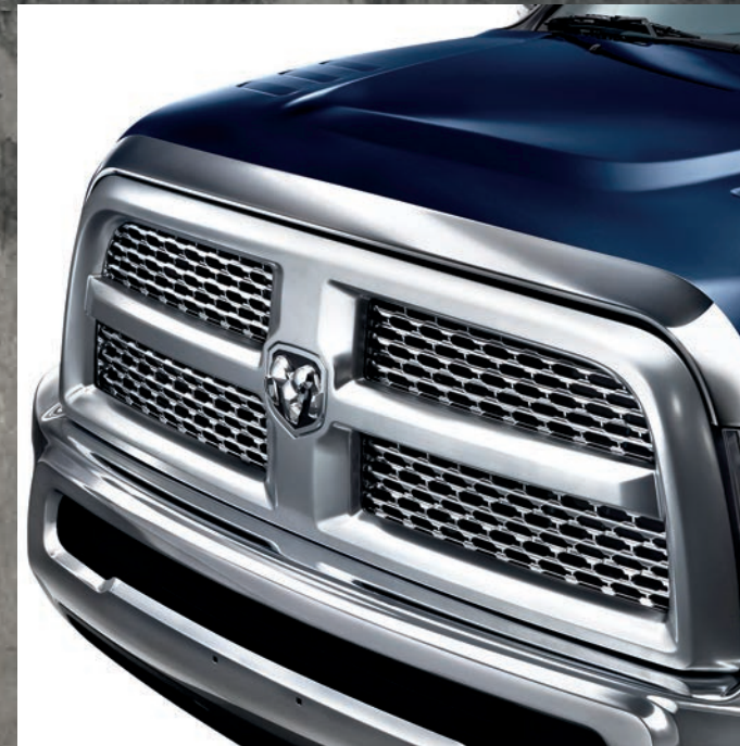
BONNET AIR DEFLECTOR (CHROME EFFECT) 82212764