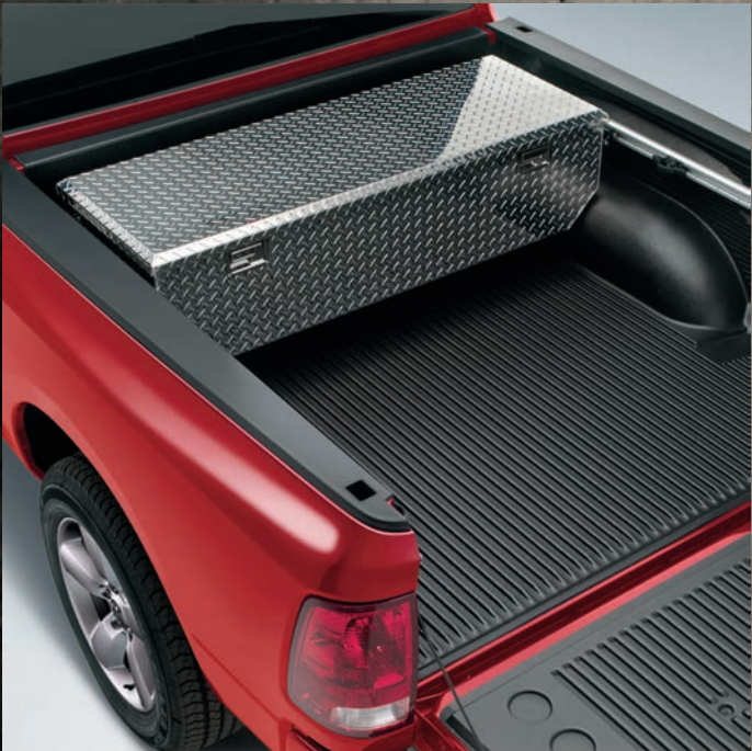
TOOL BOX - ALLOY LOOK 82211356