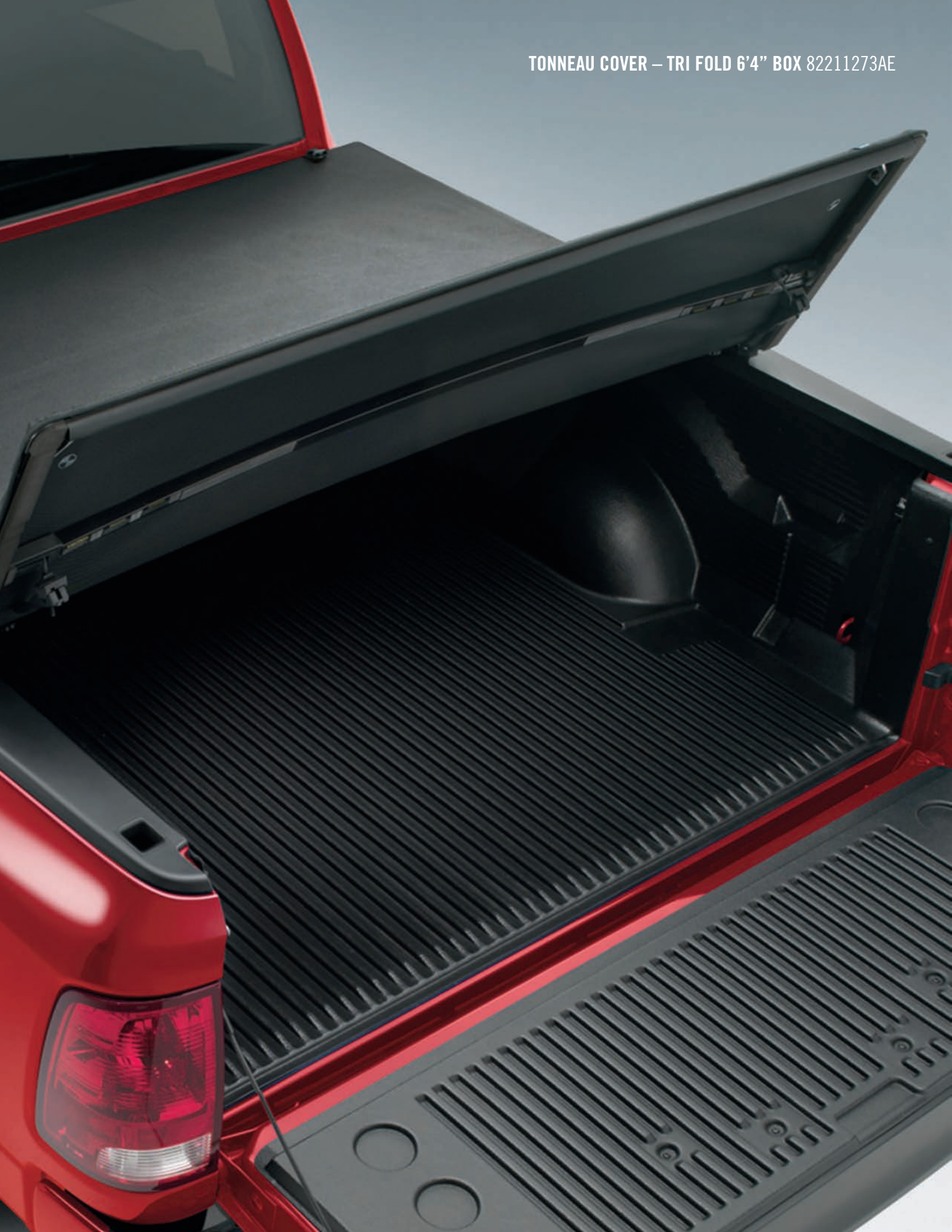
TONNEAU COVER – TRI FOLD 6'4" BOX 82211273AE