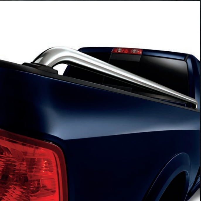
SIDE BED RAILS - 6'4" 82211811