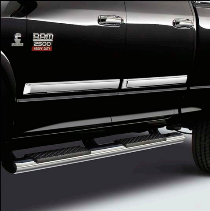
BODY SIDE CHROME EFFECT MOULDS (4 DOORS) 82213505