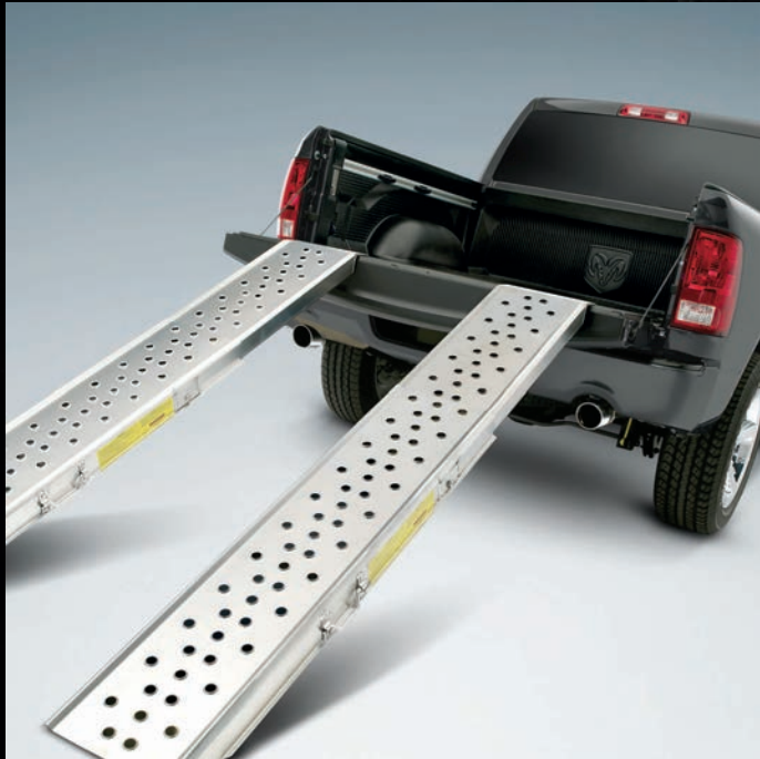
CARGO RAMPS 82211482