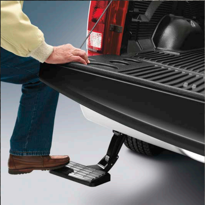
BED STEP 82212091AB