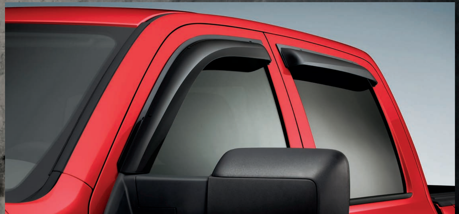
WINDOW AIR DEFLECTORS – (SET OF 4)