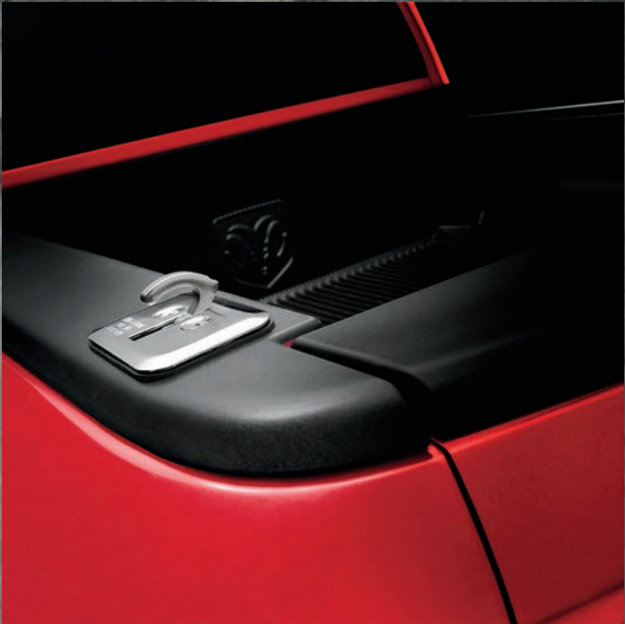
HIDE – HOOKS STAINLESS (SET OF 4) 82211736