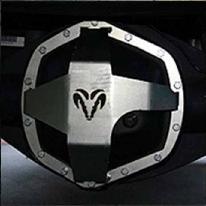
DIFF GUARD P5155678