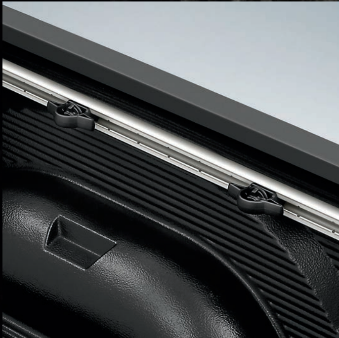
TIE DOWN RAILS (INTERNAL) – 6'4" BOX 82211058