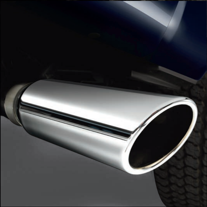
EXHAUST TIP CHROME 5 INCH O.D 82208243AB