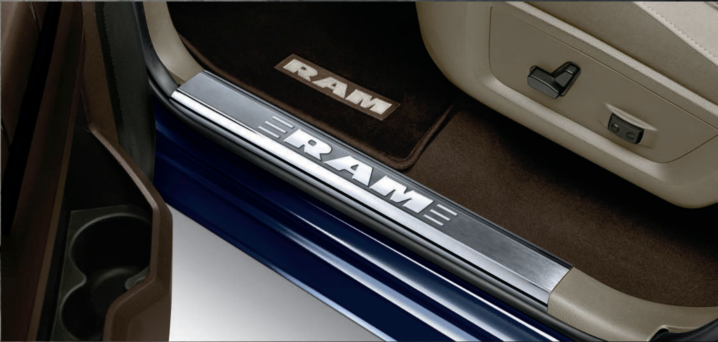
SILL PANEL COVERS IN STAINLESS STEEL 82212428AB