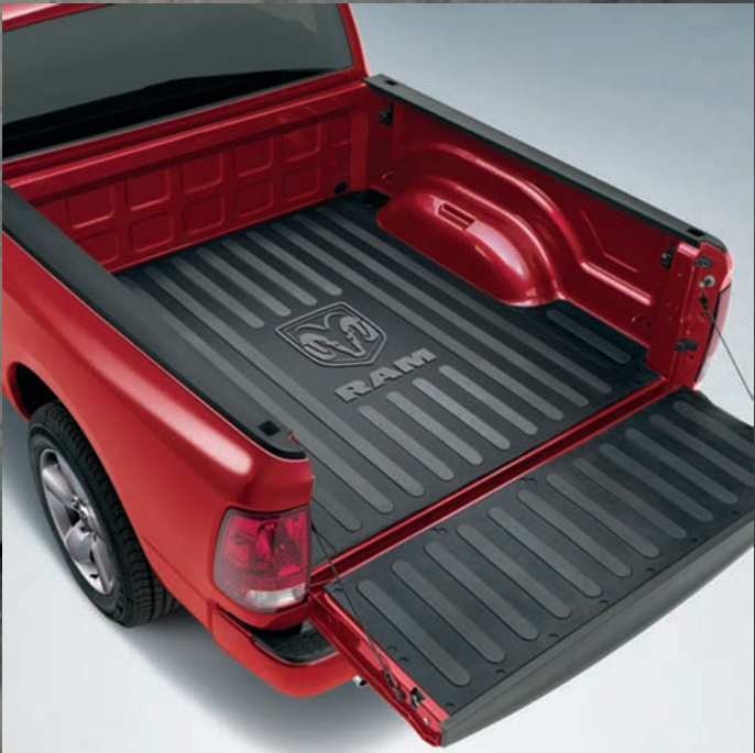
RAM LOGO BED MAT 82212996