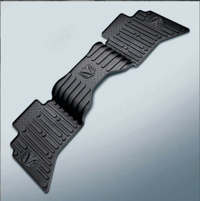
REAR SLUSH MAT 82213408