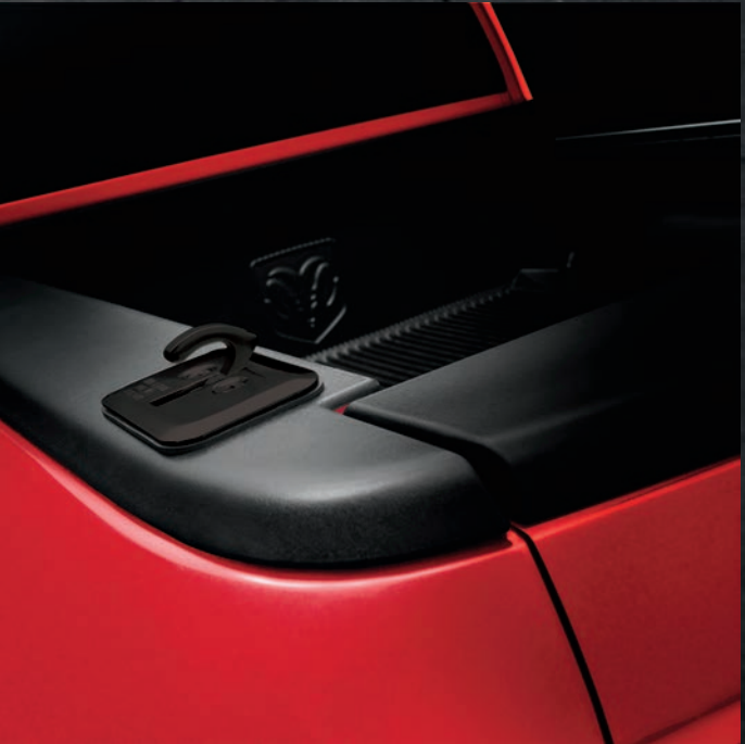
HIDE – HOOKS BLACK (SET OF 4) 82211737