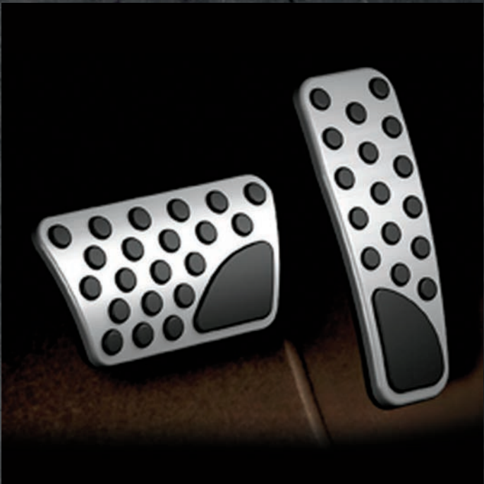
PEDAL KIT 82212138